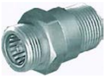
0-2300MHz 10A IEC,