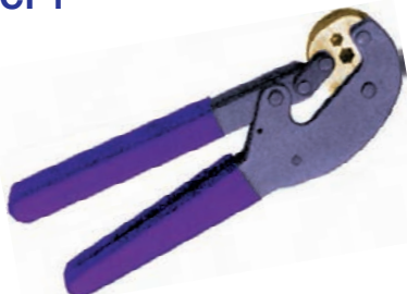
Crimp tool for FCN 11 F Connector Price £15.90